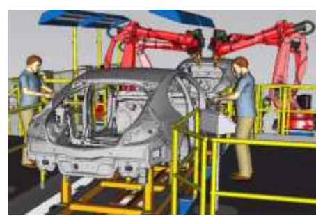
Fig. 3 VDToperator in Standing and Bending Posture