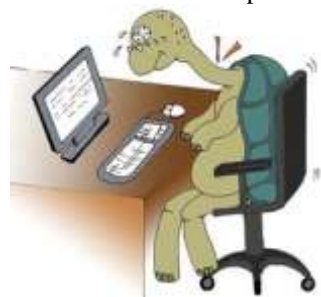
Fig.1 VDT operator work in Computer work station

In computer workstation, VDT operators work in eight, twelve hours per day. Sometime they have extra shift to cover their company target. According to eight hour shift VDT operator work 200 hours in months after leaving Sunday and in year they spend 2400 hours of time in front of computer.