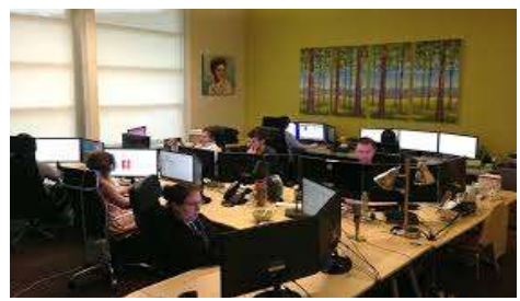
Fig. 4 VDT operator work in Different Environment.